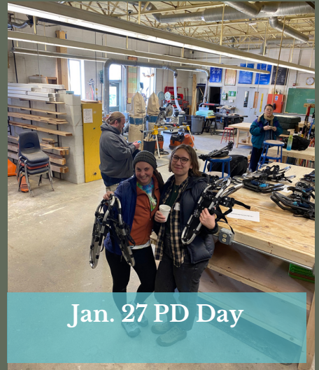
Jan. 27 PD Day