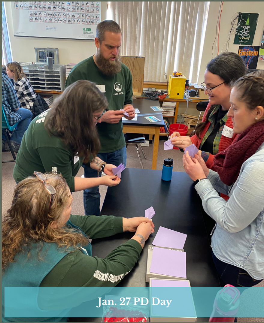
Jan. 27 PD Day