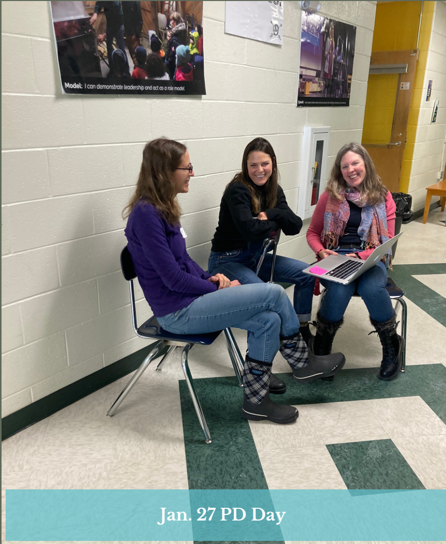
Jan. 27 PD Day