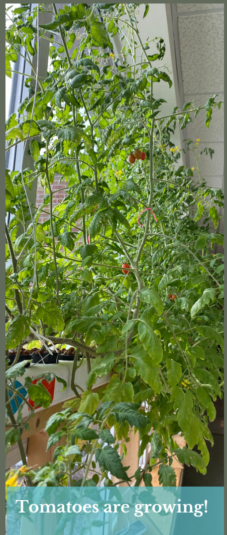
Tomatoes are growing!