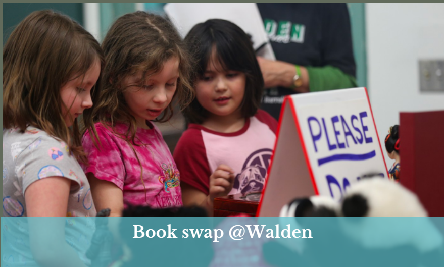
Book swap @Walden