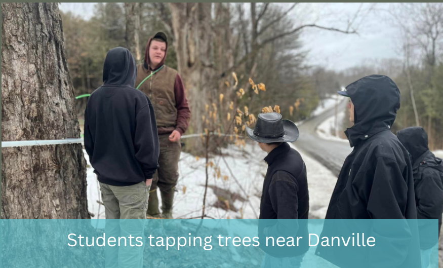
Students tapping trees near Danville