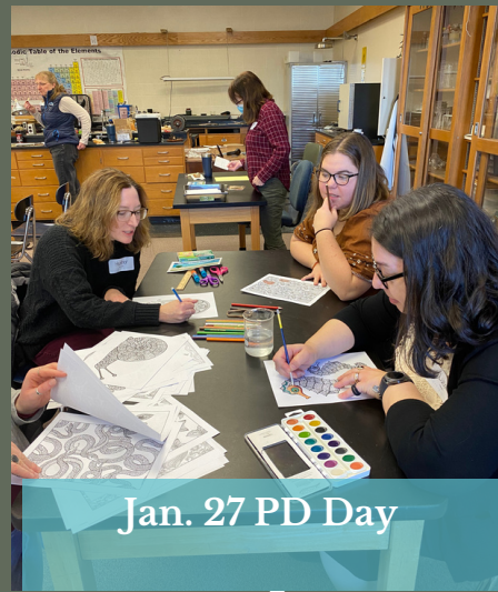
Jan. 27 PD Day