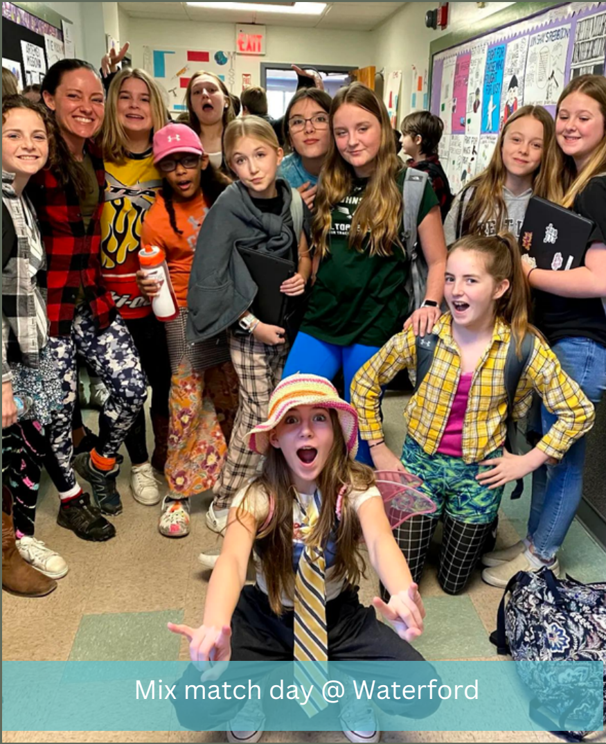
Mix match day @ Waterford