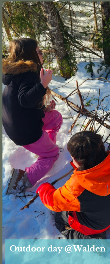
Outdoor day @Walden