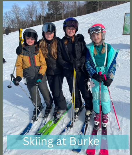
Skiing at Burke