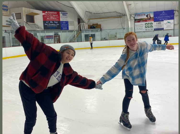
Winter wellness @Danville