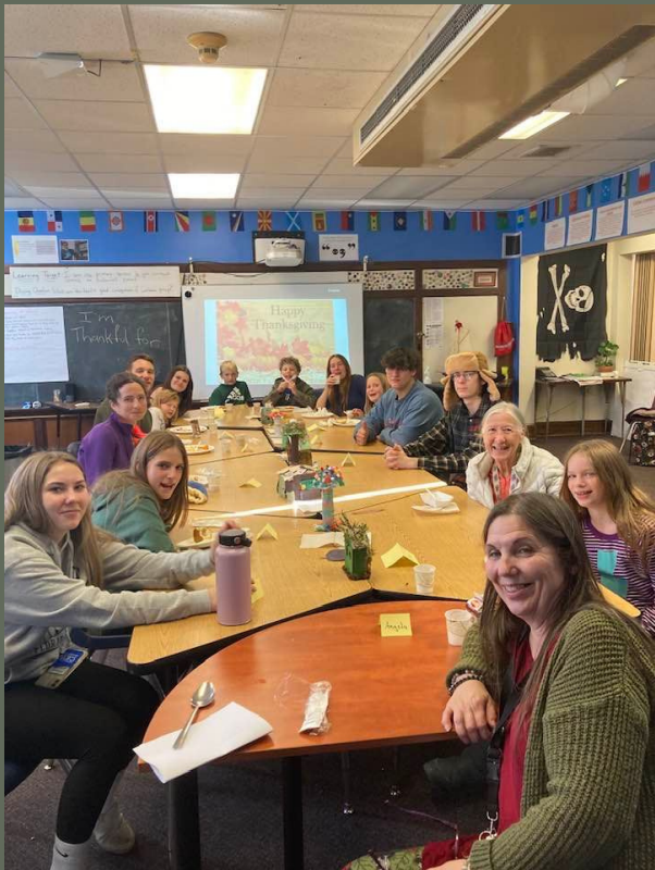
Cabot School students and staff enjoying a Harvest Meal together just before the Thanksgiving break.