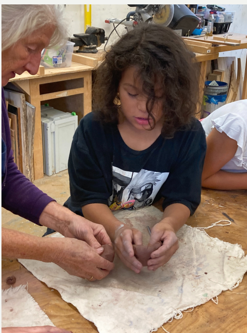
Clay making @ Cabot

Recently, while visiting a kindergarten classroom, we were chatting with some students who were drawing multimedia creations of castles and families. In the course of our visit one of the artists told a story about a dog in the picture that was hurt. Another artist at the table stopped their work and asked, “Is your dog ok?”. This is an example of compassion; this child was sympathetic and then acted on their emotion to express caring for their classmate.