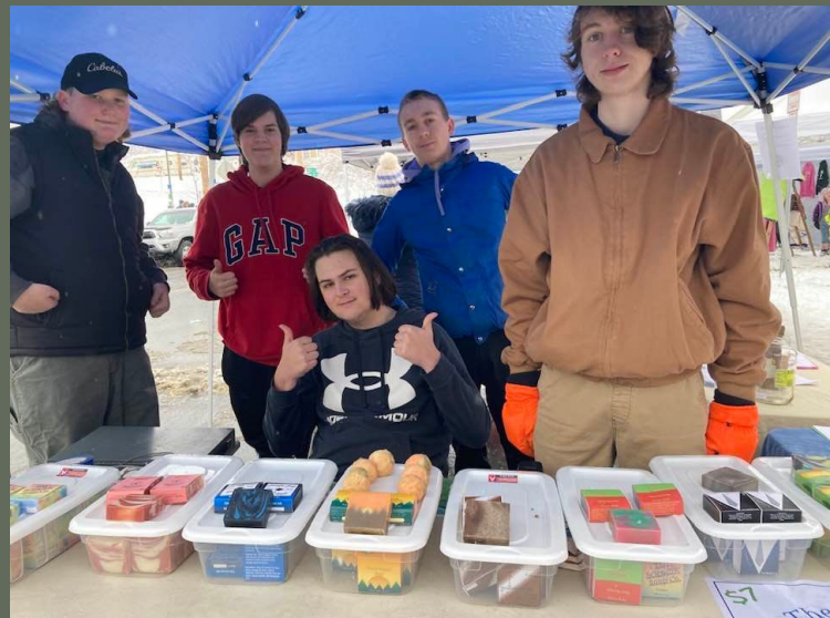
Cabot high schoolers selling the soap they made in chemistry class at the December Holiday Market in Cabot Village.