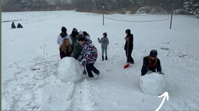
Winter fun @ Walden