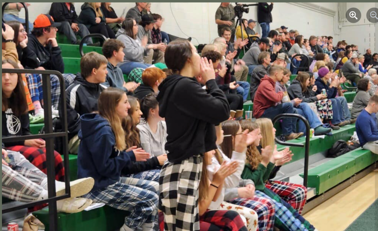
Cheering for the team @Danville