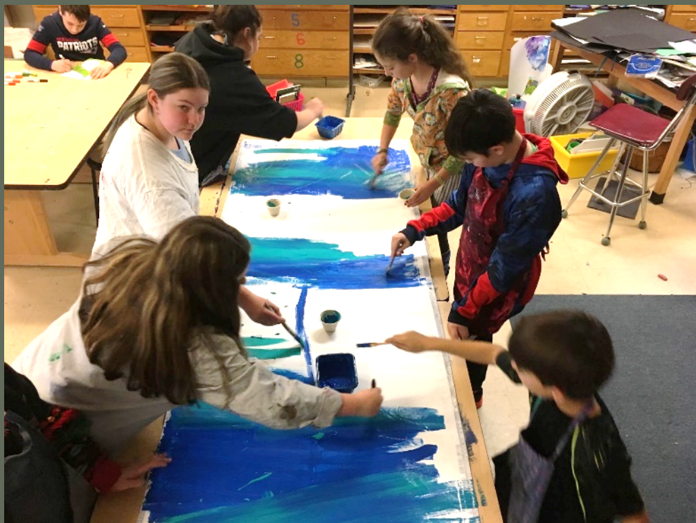
Community painting @ Barnet