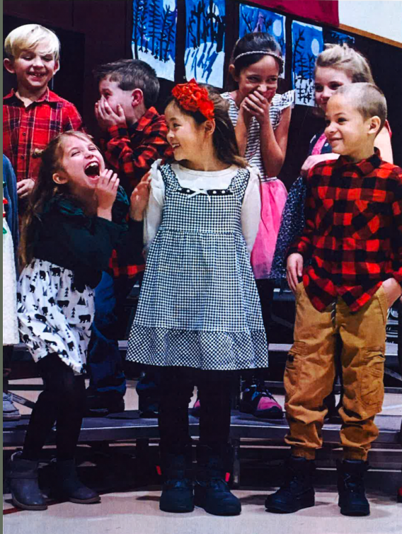
Holiday concert @ Barnet