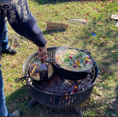
Stone Soup @ Peacham