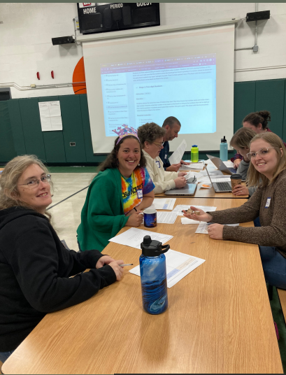
Yurt Building @ Danville