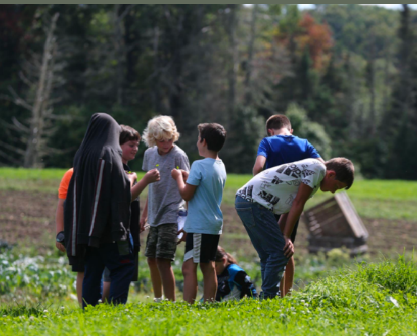
Walden students @ Harvest Hill farm